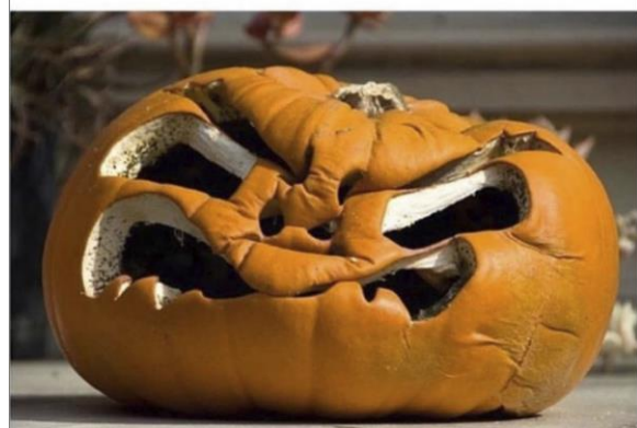
sponge.monkey on Instagram

my face when it's almost October and supposed to be hoodie weather, but it's still 90° in Fall.